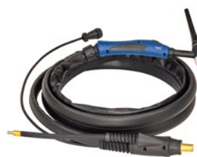
81.35.002 TIG Torch BT17