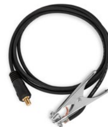
71.25.001 Work cable